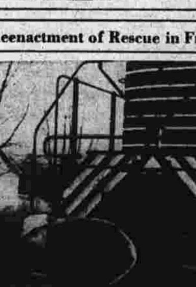
Reenactment of rescue in front of train